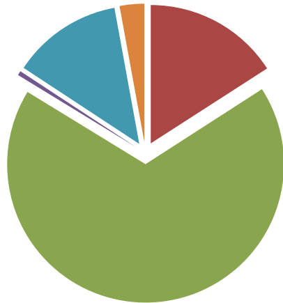
Net Admitted Assets - 3rd Quarter 2018