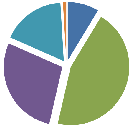
Net Admitted Assets - 3rd Quarter 2018