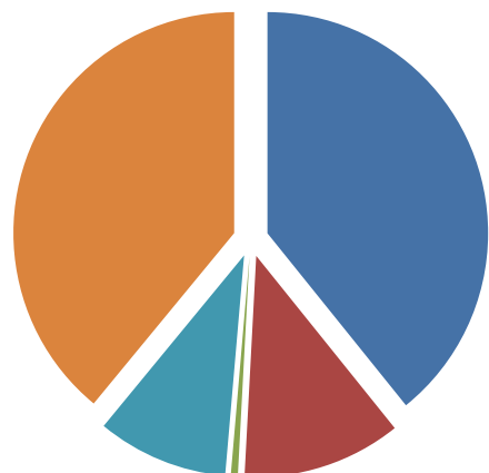
Net Admitted Assets - 1st Quarter 2018