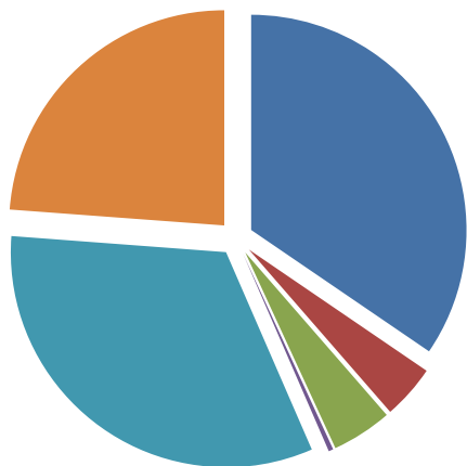
Net Admitted Assets - 2nd Quarter 2013